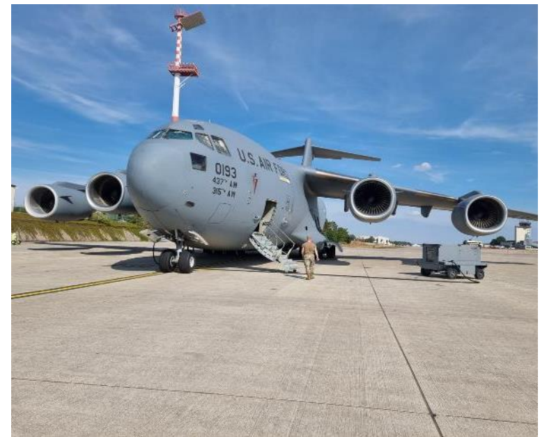
Ramstein Air Base