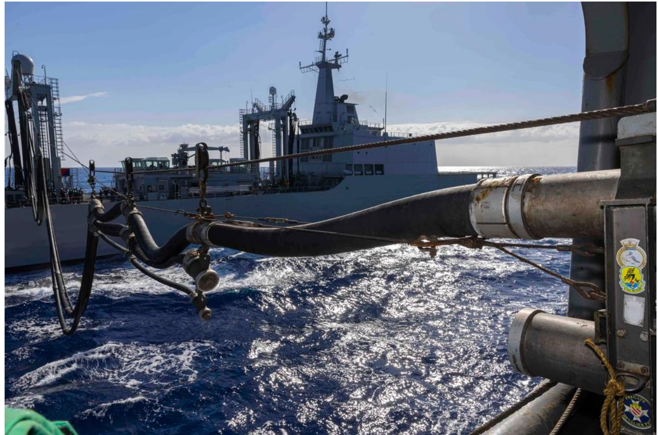
The amphibious assault ship USS Wasp (LHD 1) receives fuel from the Spanish oiler ESPS Cantabria (A 15) during a replenishment-at-sea, Oct. 18, 2024, in the Mediterranean Sea.