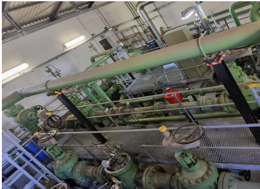
Ramstein Air Base Valve Room